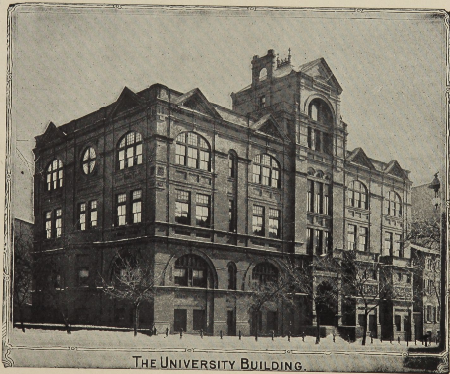
THE UNIVERSITY BUILDING.